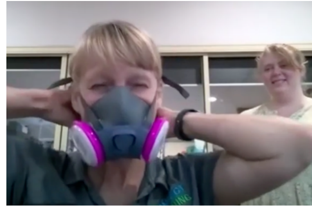
Practical Assessment Video Example

The assessment team has created both mandatory and supplementary rubric areas for each of the methodologies they assess, which helps them quickly identify exam-takers who meet the basic criteria for accreditation. If they score 80% or higher on the practical exam but do not meet all the mandatory rubric criteria, RESP-FIT releases ExamSoft's Strengths & Opportunities (S&O) Reports to each of these exam-takers that show the specific categories where they need to demonstrate improvement. The program then allows them to submit a supplementary video that covers the area(s) of improvement noted in their individual S&O Reports. From there, assessors review the supplemental video and adjust scores accordingly within ExamSCORE.